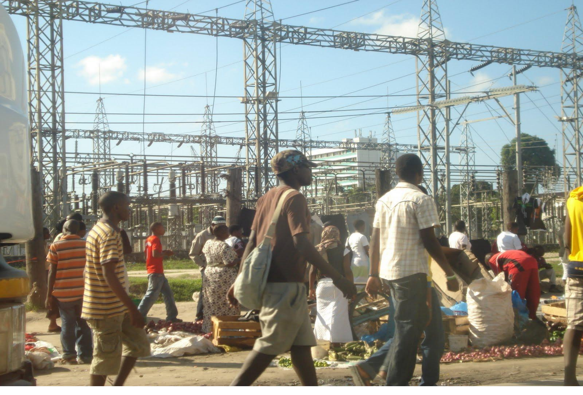
Ubongo Power Plant Dar es Salaam, Tanzania